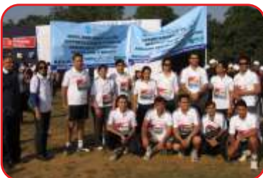
Corporate Participants for Sukarya

While focusing on primary health concerns of rural communities, Sukarya was also able to implement certain health interventions in peri-urban, slum areas of Gurgaon with the help of the funds generated through the marathon. We were able to run Sukarya Sehat Centre in Sukarya's premises at Sushant Lok catering to the basic health needs of the population residing in urban slum. The facilities provided by the Sehat centre, included free medical check-up for the poor, provision of specialized diagnosis and free medicine. Another important Sukarya intervention known as Pahal project was also possible with the funds generated through marathon. The project catered to the health needs of a population of 800 people residing in the underserved slum community of Saraswati Kunj located in sector – 53, DLF phase – V, Gurgaon.